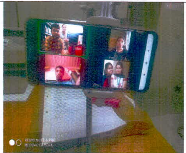
Interaction of Alumni with participants