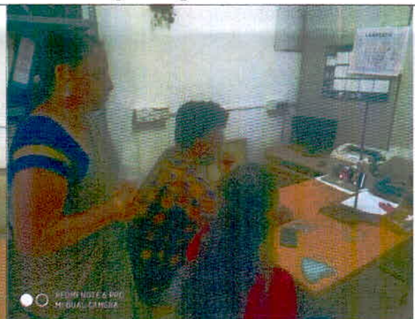
Interaction of Alumni with Staff member