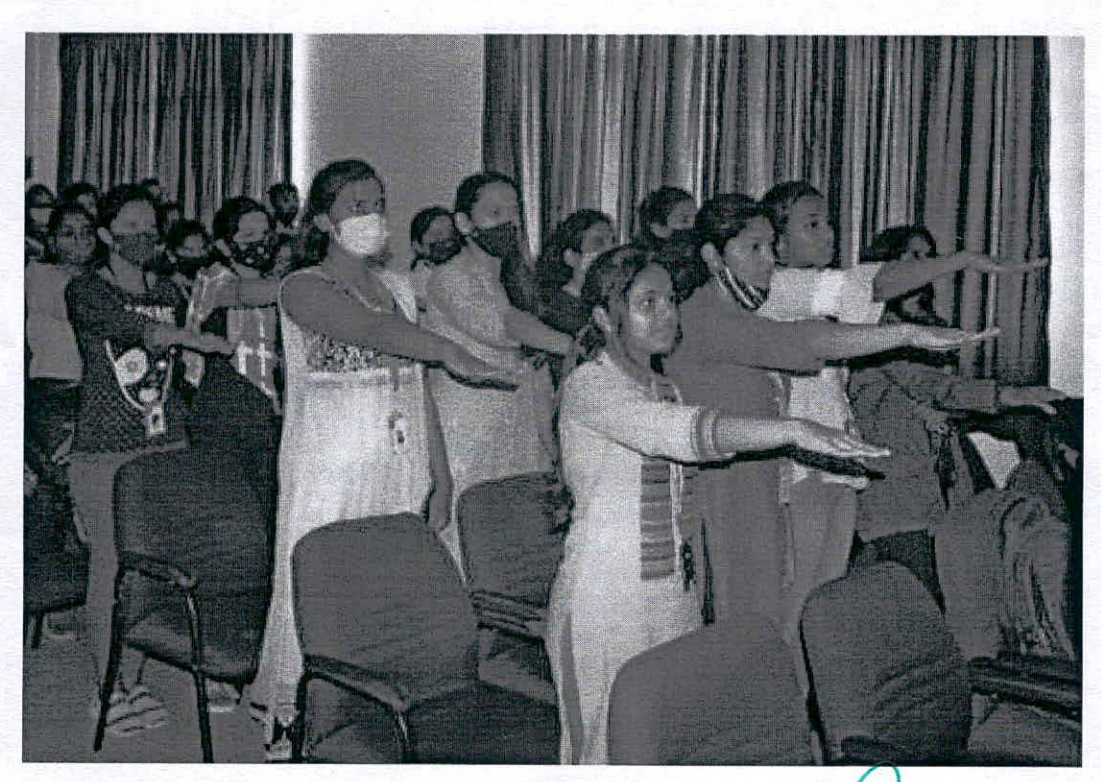
Student Reading the preamble