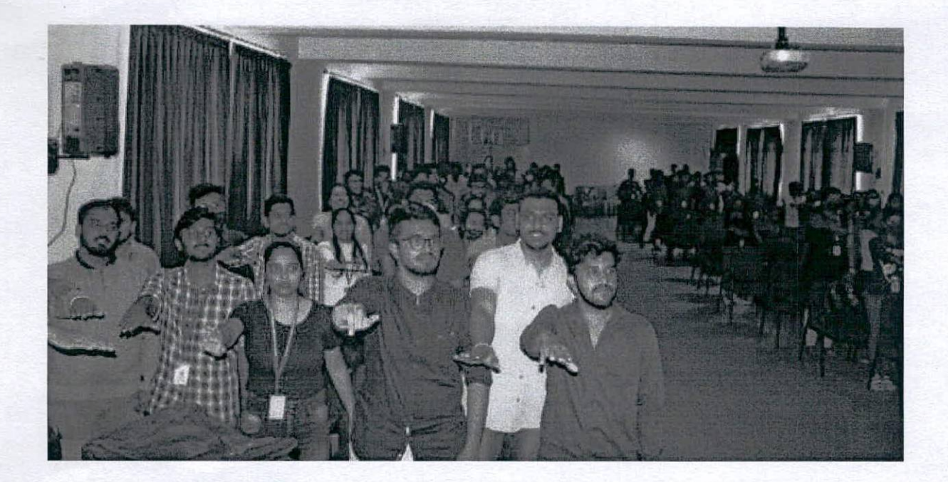
Constitution Day Pledge by students