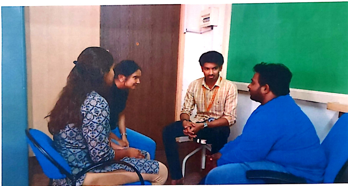
Group Discussion regarding trending technologies.