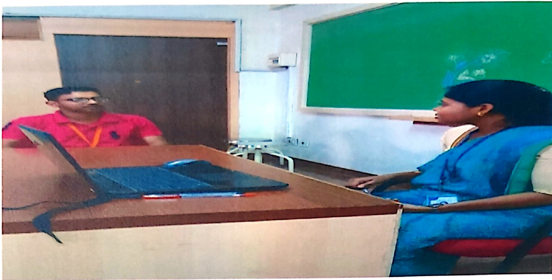
Mock Interview done by the trainer for individual student.