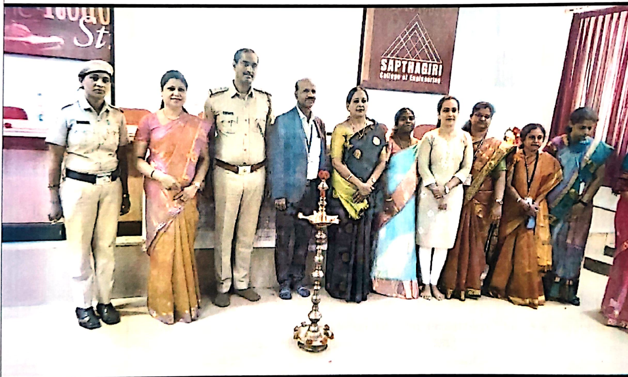
International Women’s Day with the theme “Break the Bias” was celebrated at SCE by conducting various events for the girl students and Lady faculties and staff of SCE at Sapthagiri College of Engineering, Bengaluru on 08/03/2022