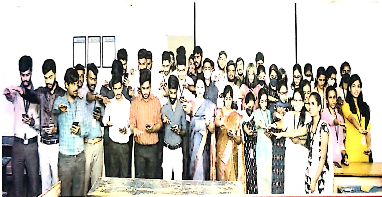
Awareness Program about "Stop different forms of terrorism including sexual terrorism" was conducted for the faculties and students of SCE on 21/5/2022