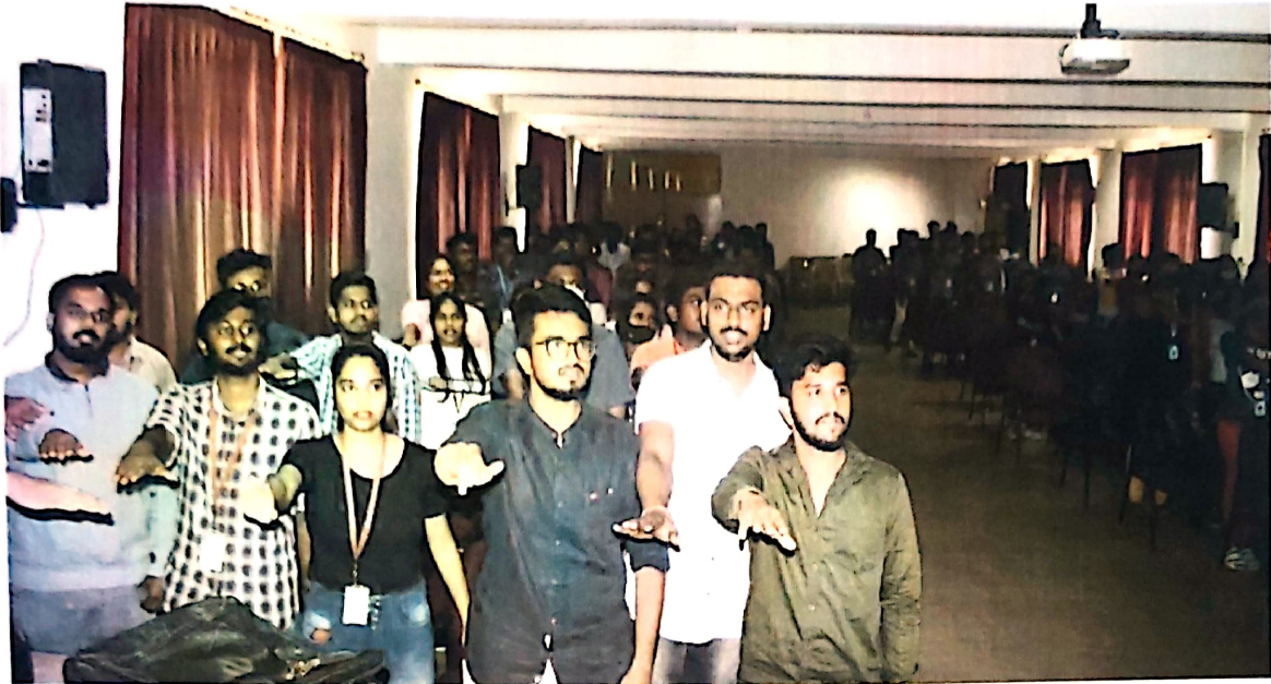
Constitution Day Pledge by the students

Phone:080-28 372800/1/2 Fax: 080-28 372797