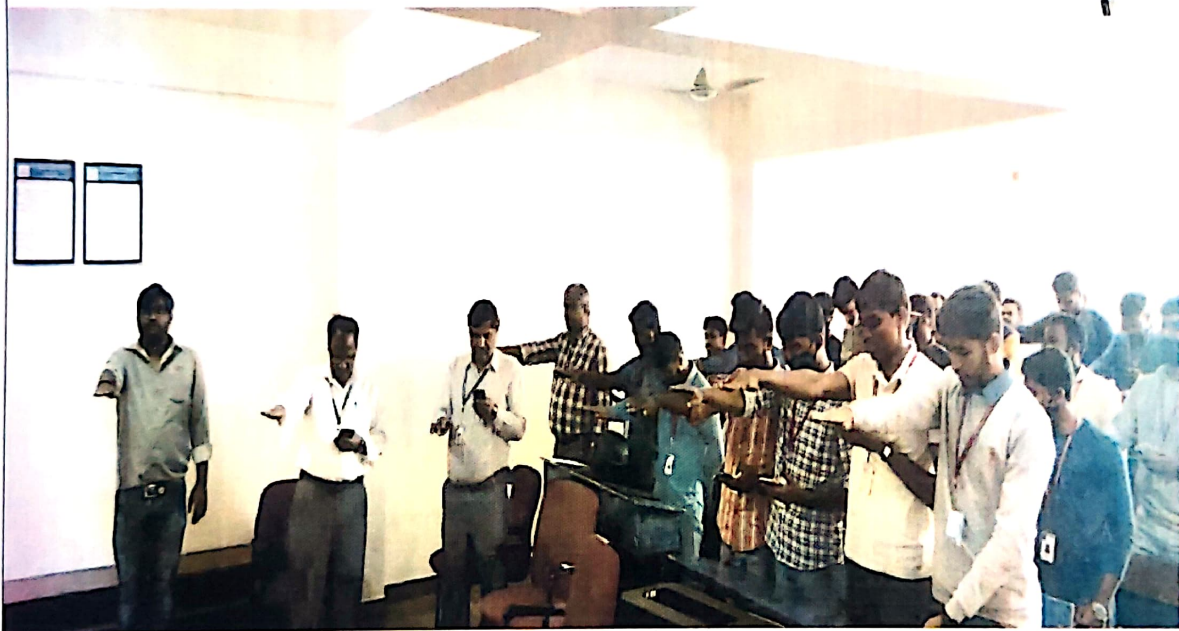
Awareness Program about “Stop different forms of terrorism including sexual terrorism” was conducted for the faculties and students of SCE on 21/5/2022