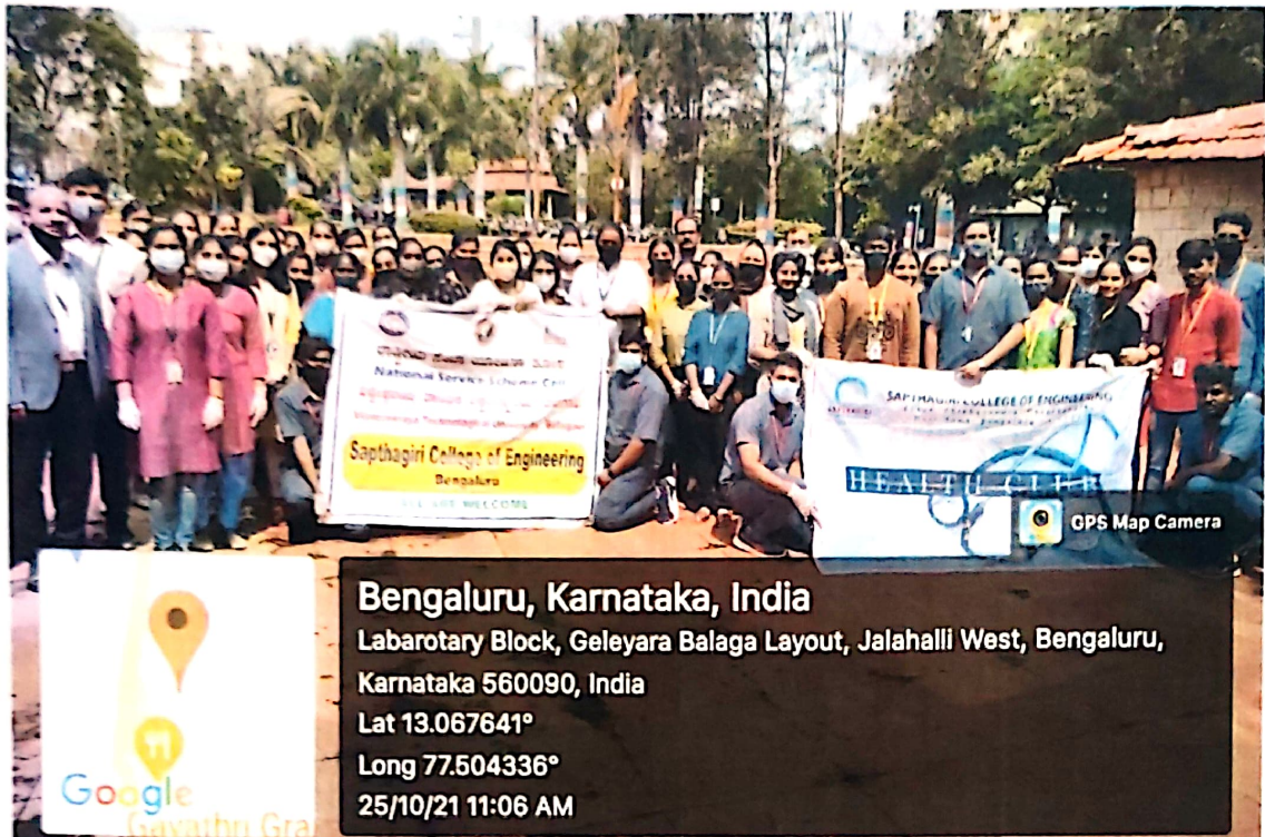
Plastic free awareness and cleaning

Phone:080-28 372800/1/2 Fax: 080-28 372797