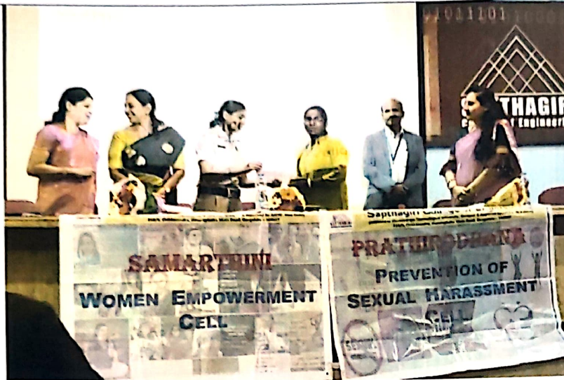
Distribution of prizes for girl student achievers for being university Rank holders, toppers and winners in various fields on 08/03/2022

Accredited by NBA & NAAC -A GRADE, An ISO 90001:2015 and 14001:2015 Certified Institution, Affiliated to Visvesvaraya Technological University, Belagavi & Approved by AICTE, New Delhi #14/5, Chikkasandra, Hesaraghatta Main Road, Bengaluru- 560 057 Web: www.sapthagiri.edu.in , Email: principal@sapthagiri.edu.in , Phone: 080-28 372800/1/2 Fax: 080-28 372797