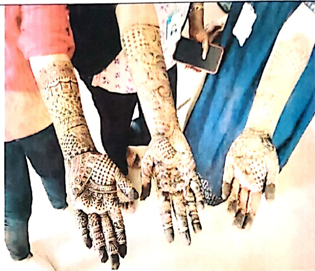
Mehendi event about “Artistic way of making livelihood to bring Equity” was conducted for the girl students of SCE on 28/12/2021.