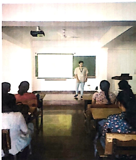
Students of SCE participated in the Debate event on “Is more Social Media to Technology leading to Sexual Abuses” on 27/10/2021