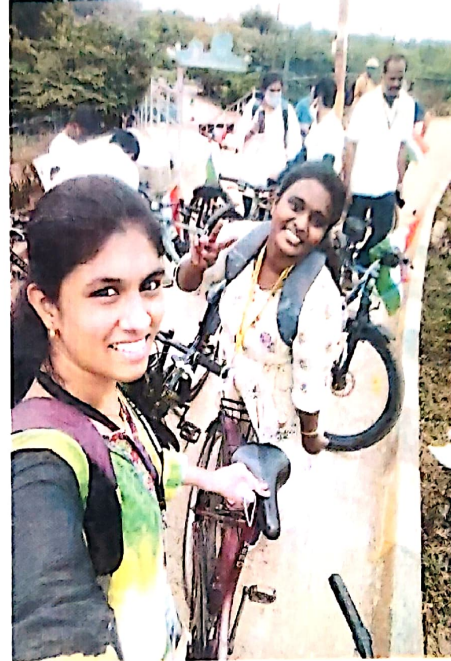
Cycle rally and cleaning program