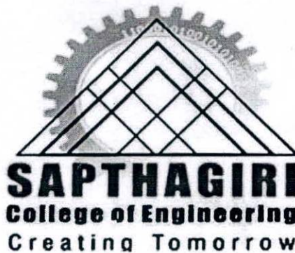
Principal Sapthagiri College of Engineering 14/5, Chikkasandra, Hesaraghatta Bangalore

DEPARTMENT OF CIVIL ENGINEERING SAPTHAGIRI COLLEGE OF ENGINEERING