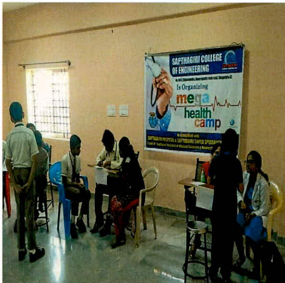
General health check-up for students by SIMS Doctors.