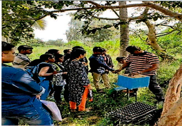
Students been briefed on Api culture by expert

"Orientation on API culture" on 03-04-2015, Wednesday