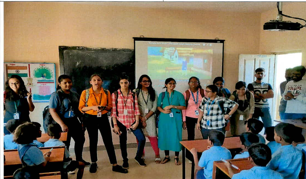
STUDENTS OF ECO CLUB AND COMMUNITY CLUB CREATING AWARENESS ON EFFECTS OF POLLUTION