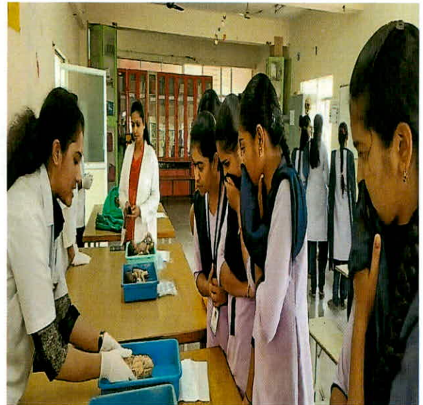
SIMS Doctors are displaying anatomy parts to students