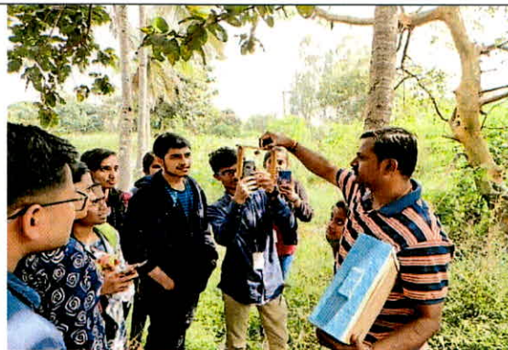
Students curiosity view on Honey bee collection box