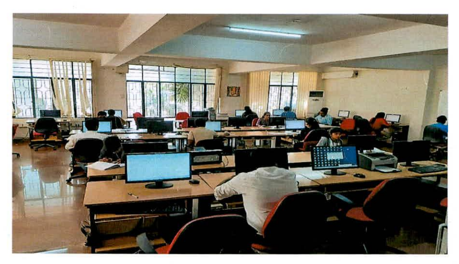
Hands on Session for the students

Principal Sapthagiri College of Engineering Chikkasandra, Hesaraghalta Road, Bangalore- 560 057