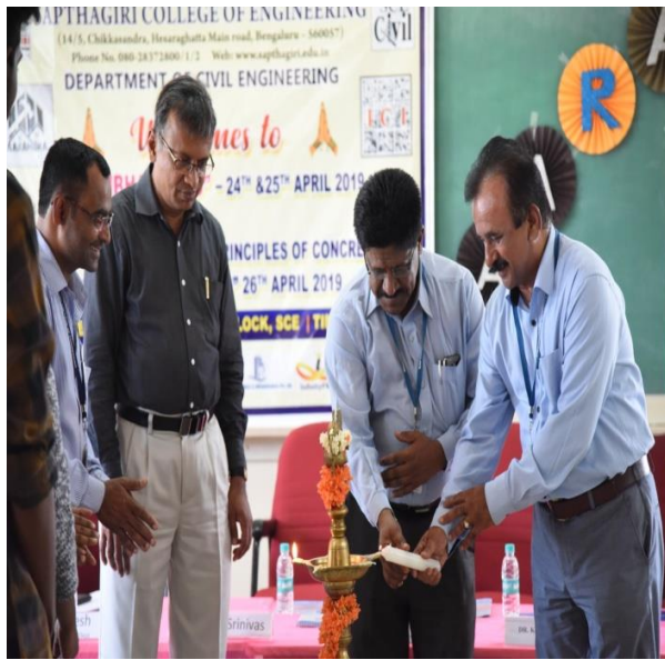
Inauguration by Lightening the Lamp.