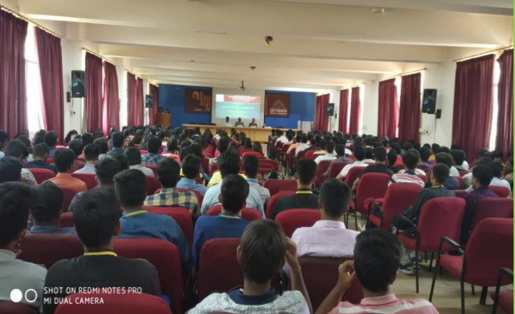
A guest lecture on "Relevance of Values in Modern Life" by Sampaturu Vishwanath was held on 30th september 2019. The guest lecture has been organized by the department of Chemistry to provide the students with an opportunity to get knowledge of human values which is necessary in modern life.