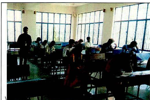
Essay competition on Climatic change

All the events were conducted successfully & sensitized the student members of HASIRU (ECO CLUB) and different communities like school students and villagers for Clean India. In the College campus, space was identified for parking of two wheelers and four wheelers by NSS and ECO-club members & made a parking lanes and zones. The campaign on save fuel for better environment in students as well as the public was a prime importance for sustainable environment. Seminar signifying about energy conservation and renewable resources sensitized students for energy conservation. Essay competition on Climatic change brought many students with lots of new and novel ideas for conservation of ecology. Our main objective of sanitation and maintaining a healthy environment for students and community was appreciated by village community, management and others.