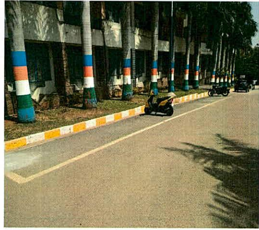
Parking Lane marked on the Road