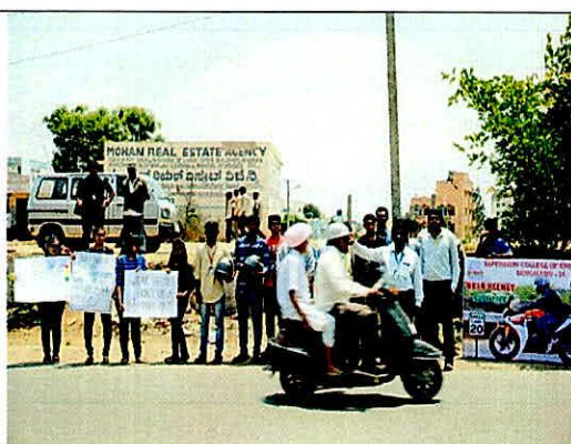
Save fuel campaign by volunteers of HASIRU