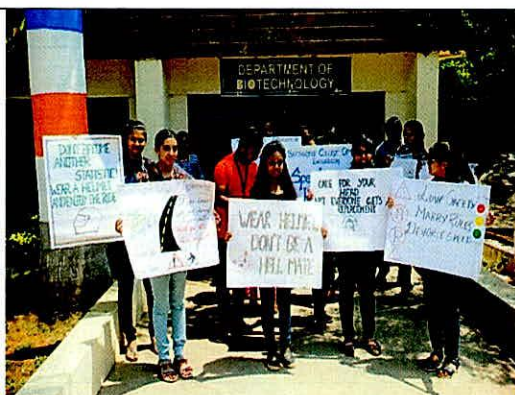
Drive on switch off engine and wear helmet

Principal Sapthagiri College of Engineering Chikasaandra, Hesaraghatta Road, Bangalore-560 057