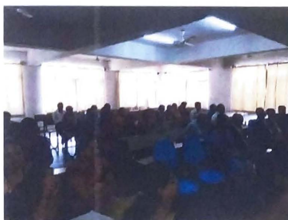
Photo of FDP on “Artificial Intelligence and Robotics” by CSE Department

10. The R & D successfully conducted two workshops entitled “Thrust area for Research in Power sector- Scope and Challenges”, “Research methodology and technical writing for Research scholars on 20/05/2017 and 6/11/2017 respectively.