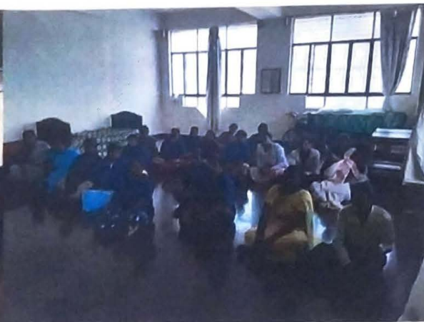
Photo of Workshop on “Awareness on Fitness” for all Non-Teaching Faculties.