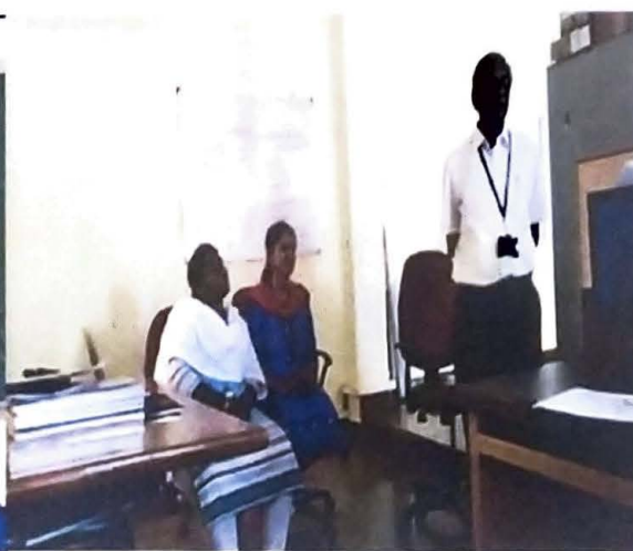
FDP on “Digital Signal Laboratory” by EEE Department