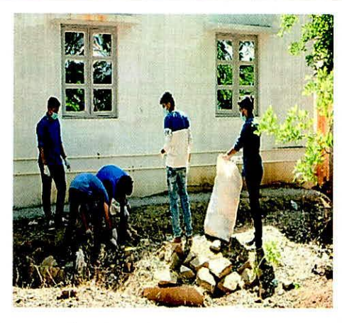
Students collecting the waste plastic bottles