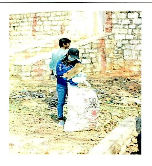
Cleaning near the college