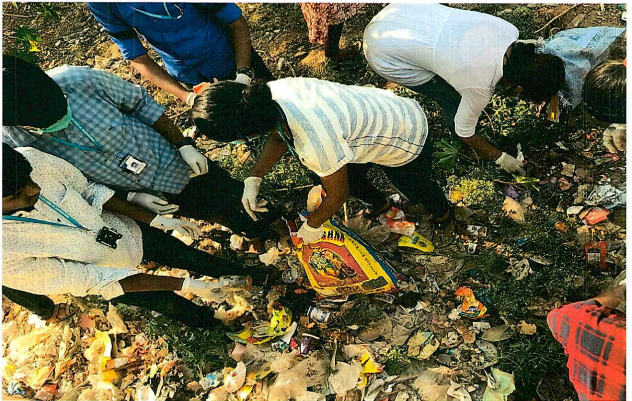
STUDENTS ACTIVE INVOLEMENT FOR THE CLEAN OF HESARGHATTA ROAD CAMPAIGN.