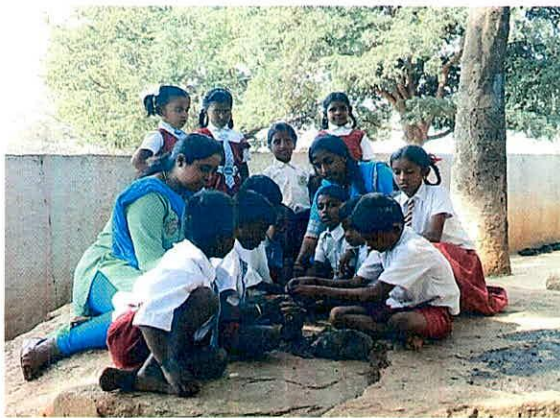
Children preparing clay Ganesha

All the events were conducted successfully to sensitize the students and the community. To sensitize the people about the adverse effects of plastic usage. Educating students on ill effects of POP models like Ganesha idol at the time of Ganesha festival which affects the aquatic animals. Educating public on tobacco and its effects. Health check up is conducted in mega health camp. A campaign to instill the importance of wearing helmet / seat belt in students as well as the public. Cleaning of surrounding area near schools and colleges. The Swachh Bharat Abhiyan was the most significant program about cleanliness campaign by the Government of India. To implement this in our campus, Faculties and Students along with volunteers of HASIRU Eco-Club, team NSS and Community club joined hands to progress this event in and around the campus. Focusing on sanitation and maintaining a hygienic and healthy environment.