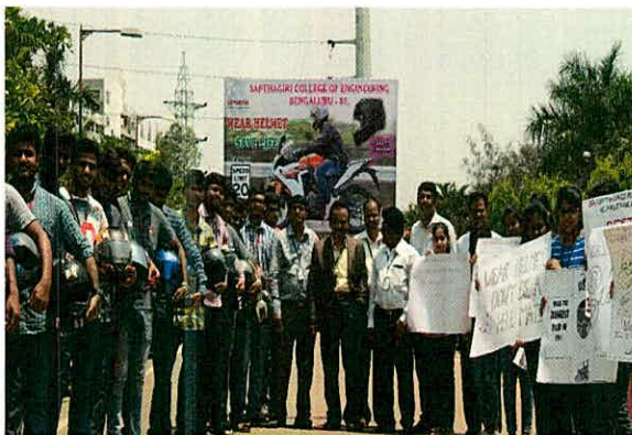
Traffic and Helmet awareness