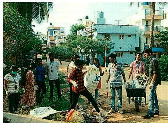
Plastic awareness for public