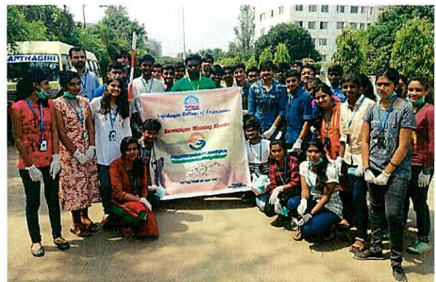
Swachh Bharath Team