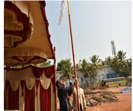
College Flag hoisting