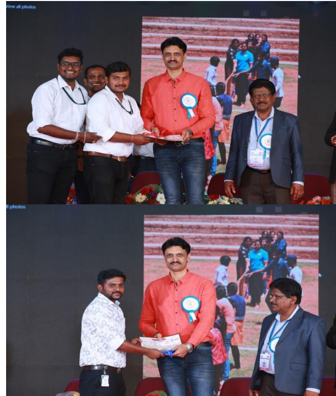
Faculty sports achievers