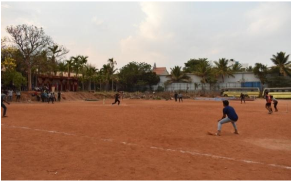
Tennis ball Cricket