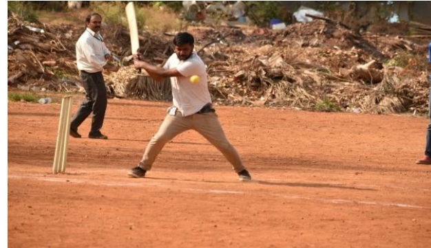
Tennis Ball Cricket