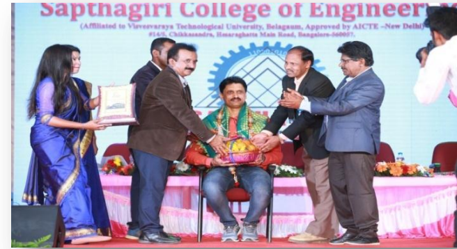
Honoring our Chief guest by PRINCIPAL , A O & HOD