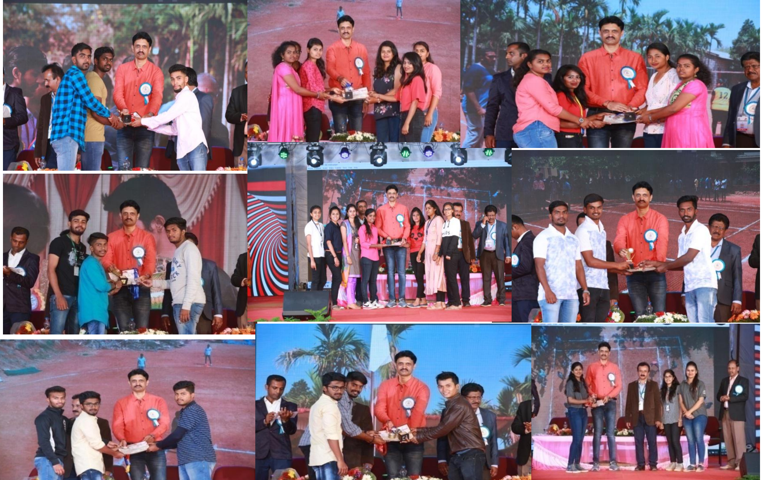
AWARDS DISTRIBUTION TO THE VICTORY TEAMS