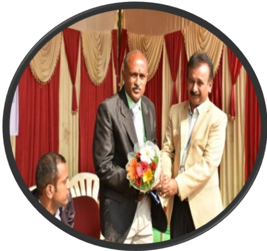
Principal welcoming our chief guest