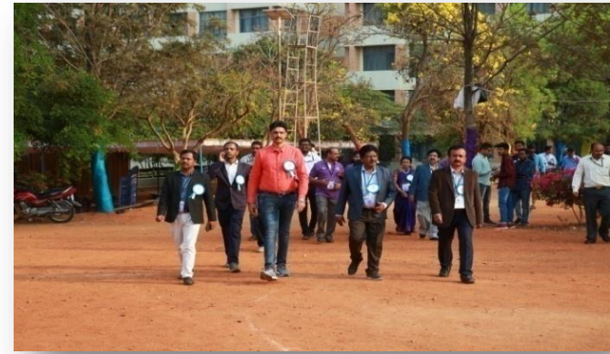
CHIEF GUEST ACCOMPANIED BY SCE