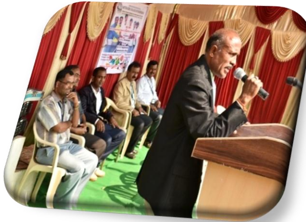
Chief Guest speech