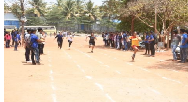
100 m (W)