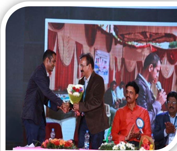
PED welcoming our Principal