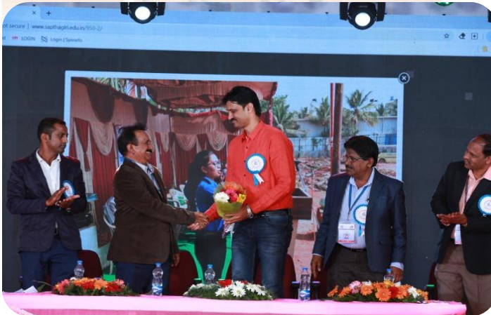
Principal welcoming our chief guest