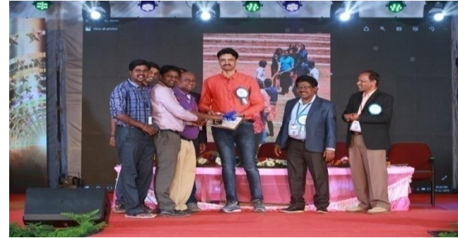
Faculty sports achievers