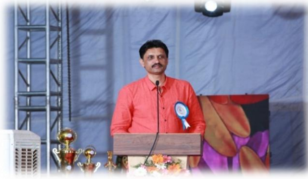
Chief guest Speech