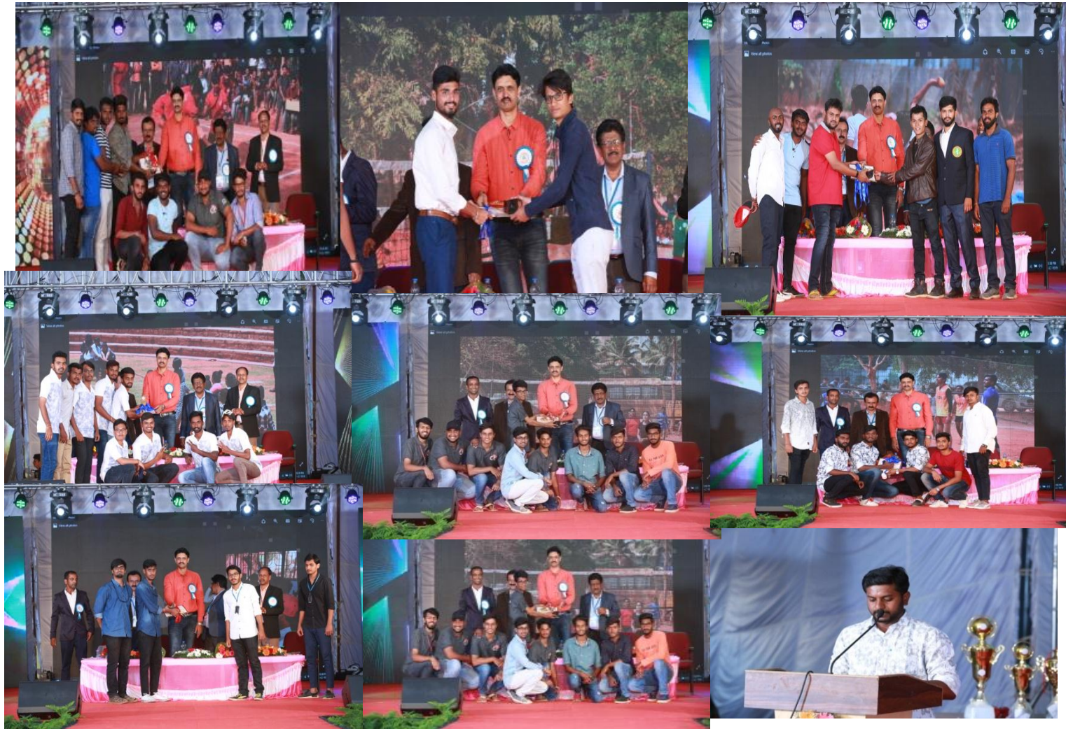
AWARDS/PRIZE DISTRIBUTING TO THE VICTORY TEAMS