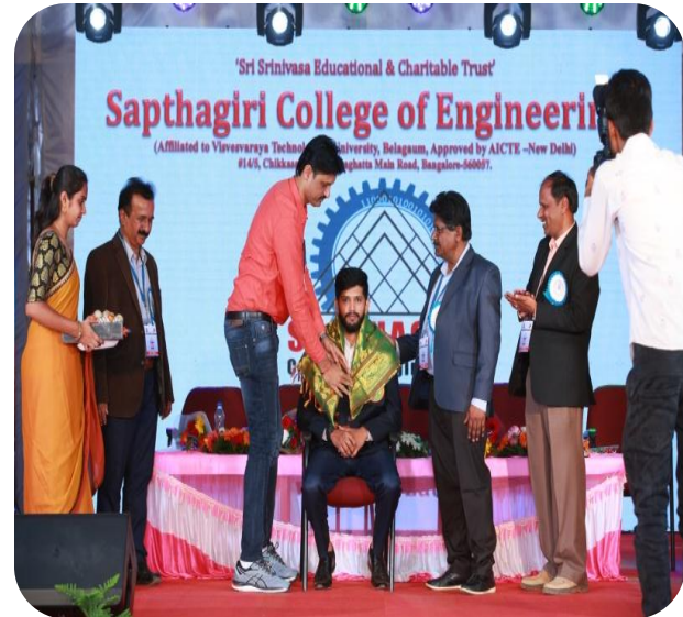
Honoring E. S Sri. Srinivasa Ramanjam By SCE