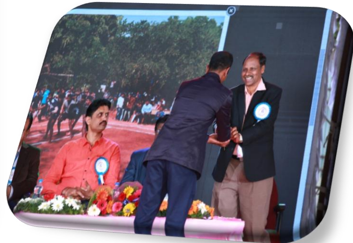
PED welcoming our SANKALP fest Secretary