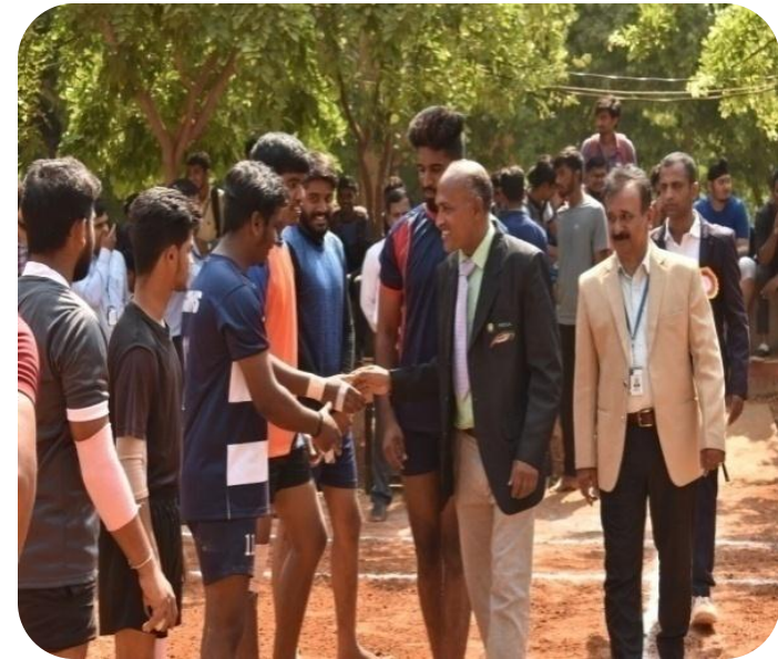
Kabaddi Team Introductions