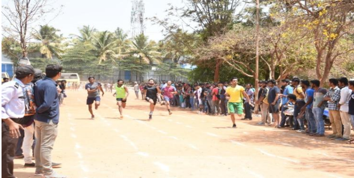
100 m (M)

On 23/03/2019 , Sports Activities : 100mtr, 200mtr, 1500mtr, Shot-put, Discuss throw